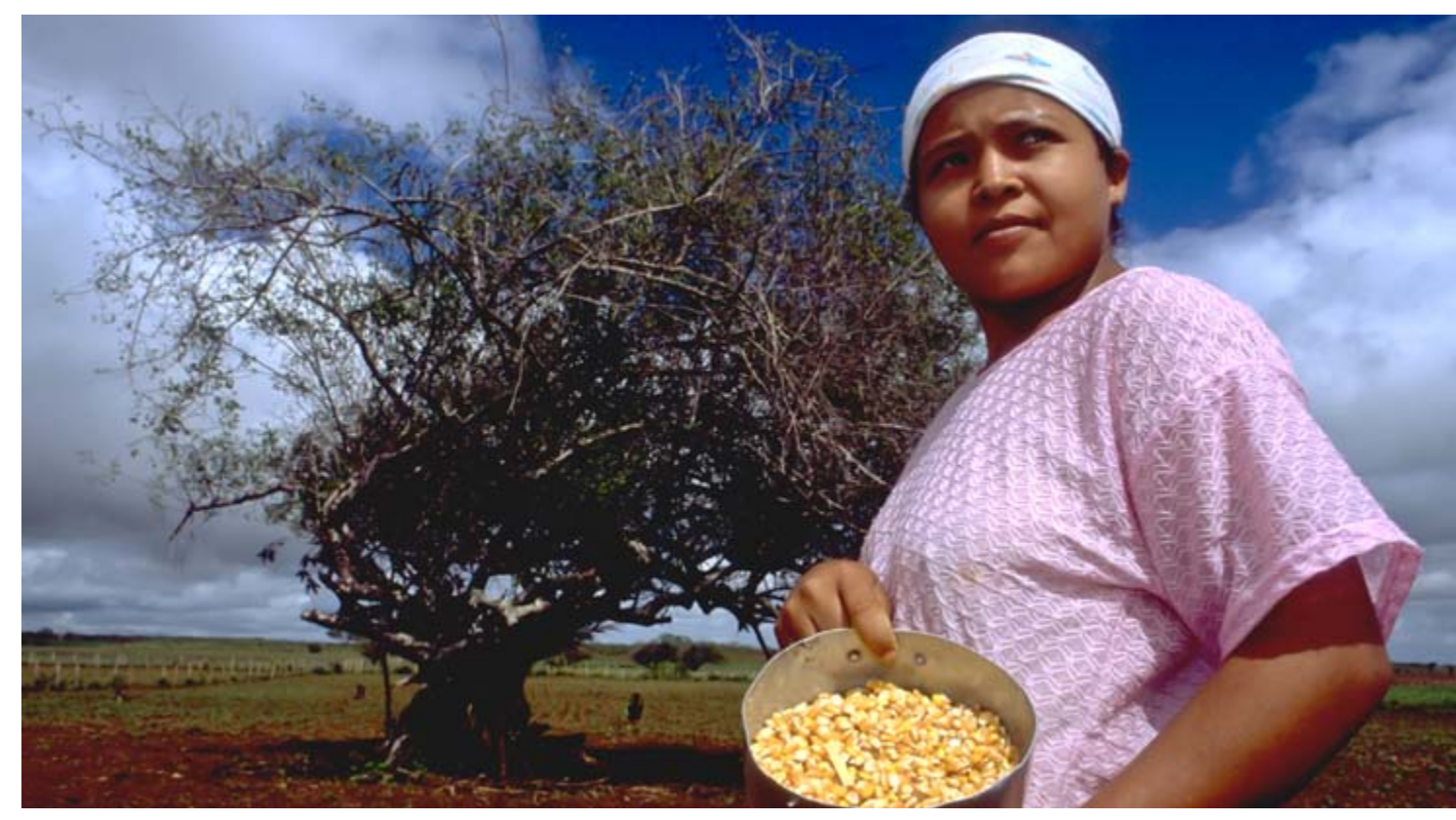
A woman plants maize in Poco Verde in the Brazilian state of Sergipe. Policies that improve producers' access to markets are crucial in efforts to tackle poverty and hunger.