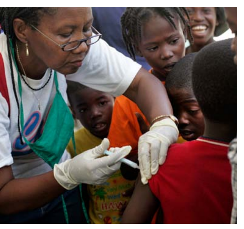
Cuban doctors administer diphtheria and tetanus vaccinations provided by the World Health Organization (WHO) to children at Delmas 33 IDP camp in Port-au-Prince for Haitians displaced by the earthquake.

In terms of revenue, these firms have seen their share of the vaccine market rise from approximately 50 percent in 1988 to about 70 percent in 2005. Small to medium-sized companies in Korea, India and Indonesia account for an additional 10 percent of the market share, with the remaining revenues going to small industrialized and developing country producers.