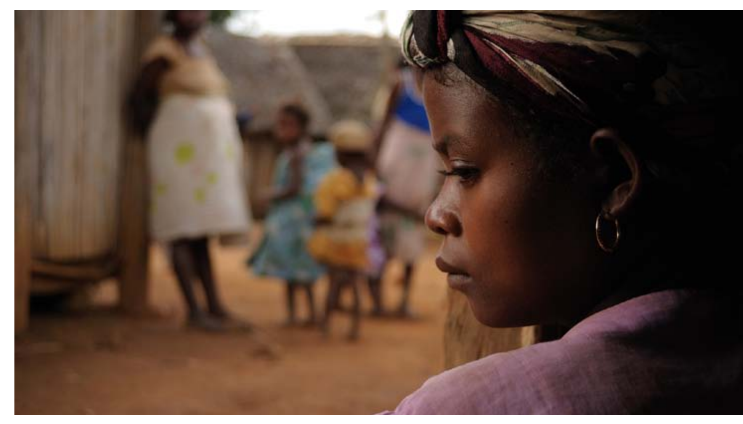
The Government of Madagascar's family planning programme, which uses a semi-autonomous not-for-profit organization for contraceptive procurement, is working to improve maternal health.