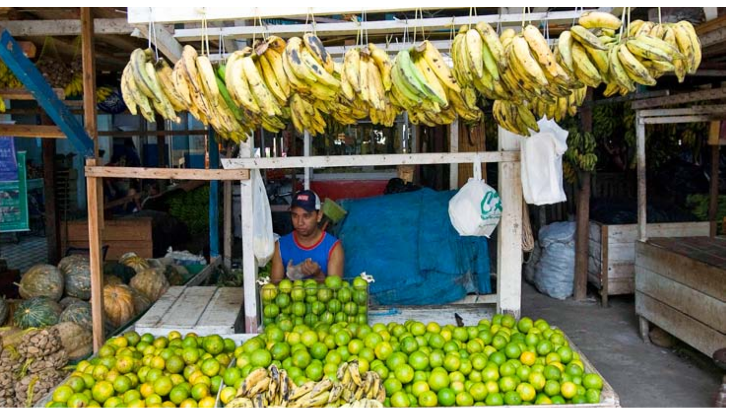
A variety of locally produced fruit for sale at a Brazilian market. The diversity of produce that smallholders can grow has been increased by the Food Acquisition Programme (PAA).

as matters beyond their control, such as weather-related damage to their crops.