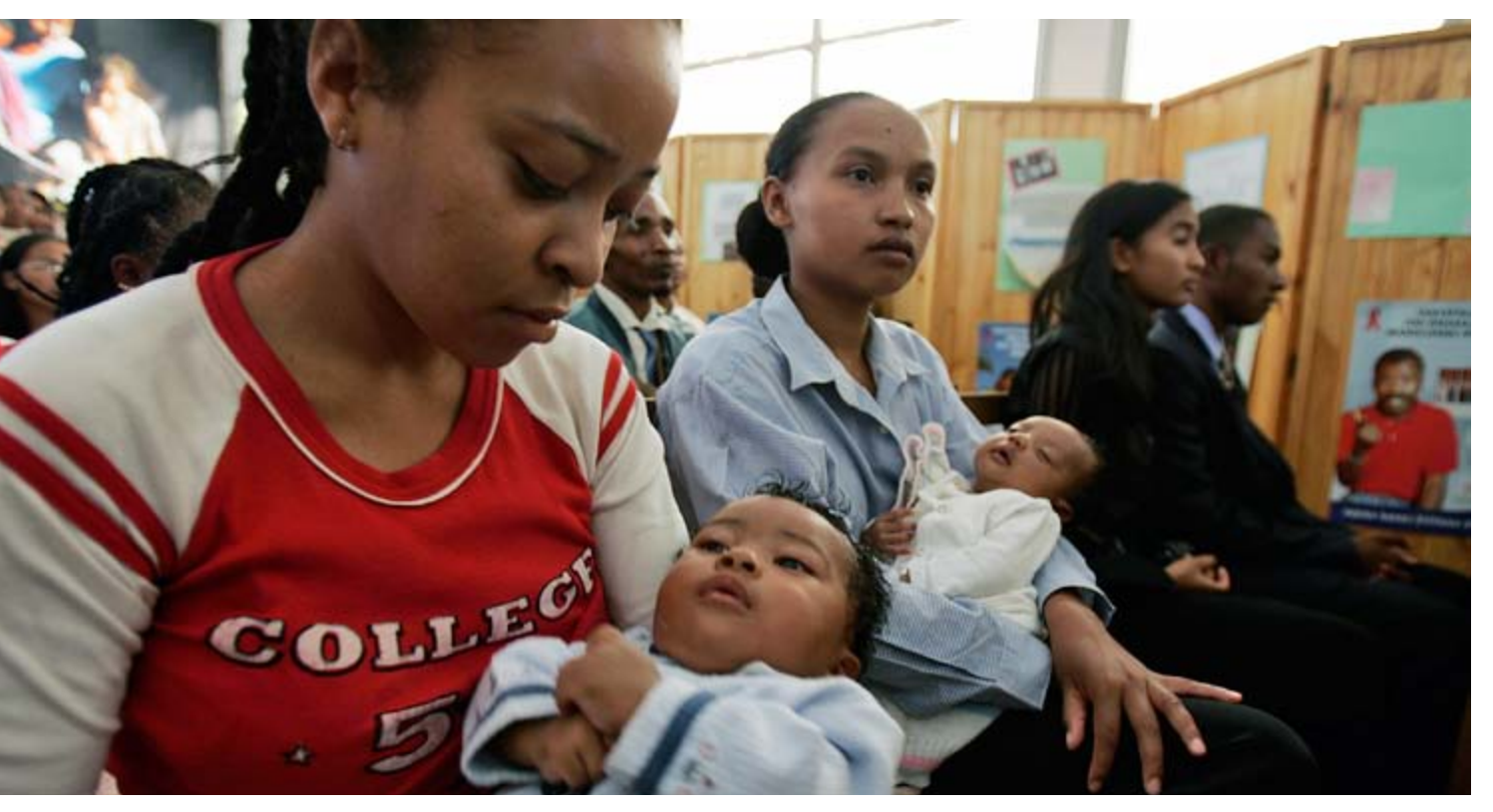
Mothers and their babies at a primary health centre ante-natal care site with voluntary counselling and testing, family planning and reproductive health in downtown Antananarivo, Madagascar.

is difficult for it to plan for customer demand, given that quantification for contraceptives is managed by the DFP. The data available to SALAMA come in the form of orders placed by its customers, and some customers are irregular in their ordering practices. Accordingly, SALAMA has to deal with a substantial number of emergency orders during the course of a year.