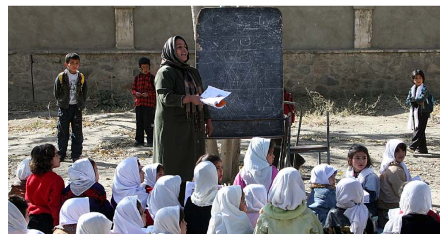
Afghan school children attending class with the support of the United Nations Children's Fund, which in 2008 enrolled nearly 340, 000 girls in grade one. There are 6.2 million children today studying in primary and secondary schools across the country.

manufacturers to track progress and identify problems. Countless obstacles were encountered: obtaining exemption certificates; getting custom clearance on time; negotiating port charges; flooded roads; identifying local focal points and ensuring they were ready to receive the supplies and more.