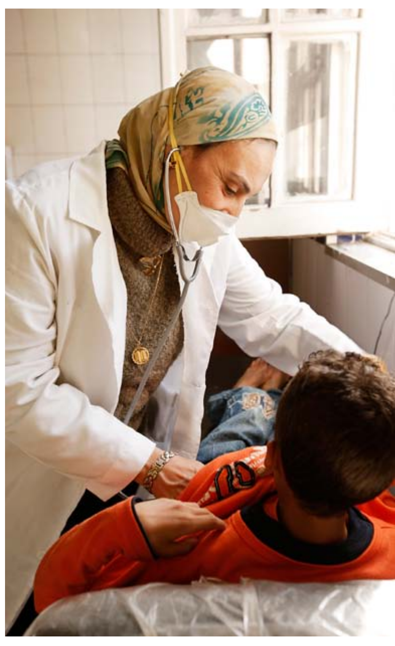
A health worker examining a TB patient. The Global Drug Facility helps drive universal access to anti-TB drugs, and supports the development of efficient national systems for their procurement and distribution.

The Global Drug Facility has laid a solid foundation on which progress can be based in the face of the challenges posed by ensuring access to anti-TB drugs. With an innovative Global Plan, assistance from the Stop TB Partnership, and new partners such as the Global Fund and UNITAID, the landscape is rich with potential for gains in the fight against TB.