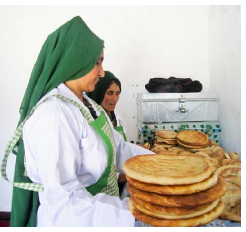
A women's group set up a bakery with the support of the Sida-funded project in order to sell bread to workers and bus passengers.

advantages of bringing money into the community and providing women with new skills, as well as promoting the idea that women can be key economic players in society.