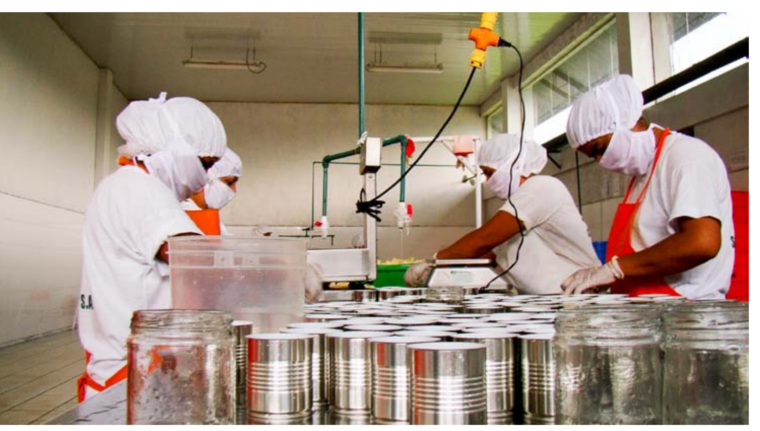
A small food processing business in Peru. When making procurement decisions, many public organizations give preference to local business to nurture small and medium enterprises (SMEs) with the underlying rationale that SMEs drive economic development.