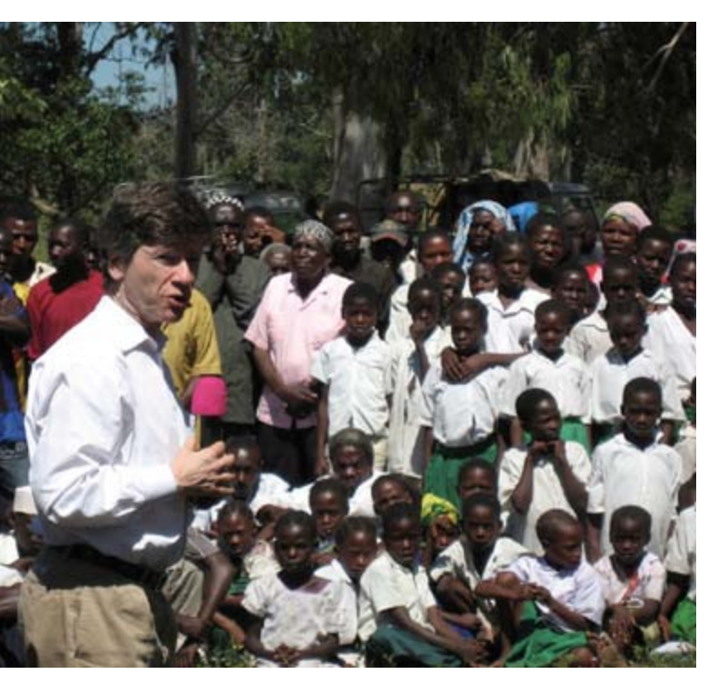
Jeffrey Sachs is internationally renowned for his work with international agencies on problems of poverty reduction, debt cancellation for the poorest countries and disease control.