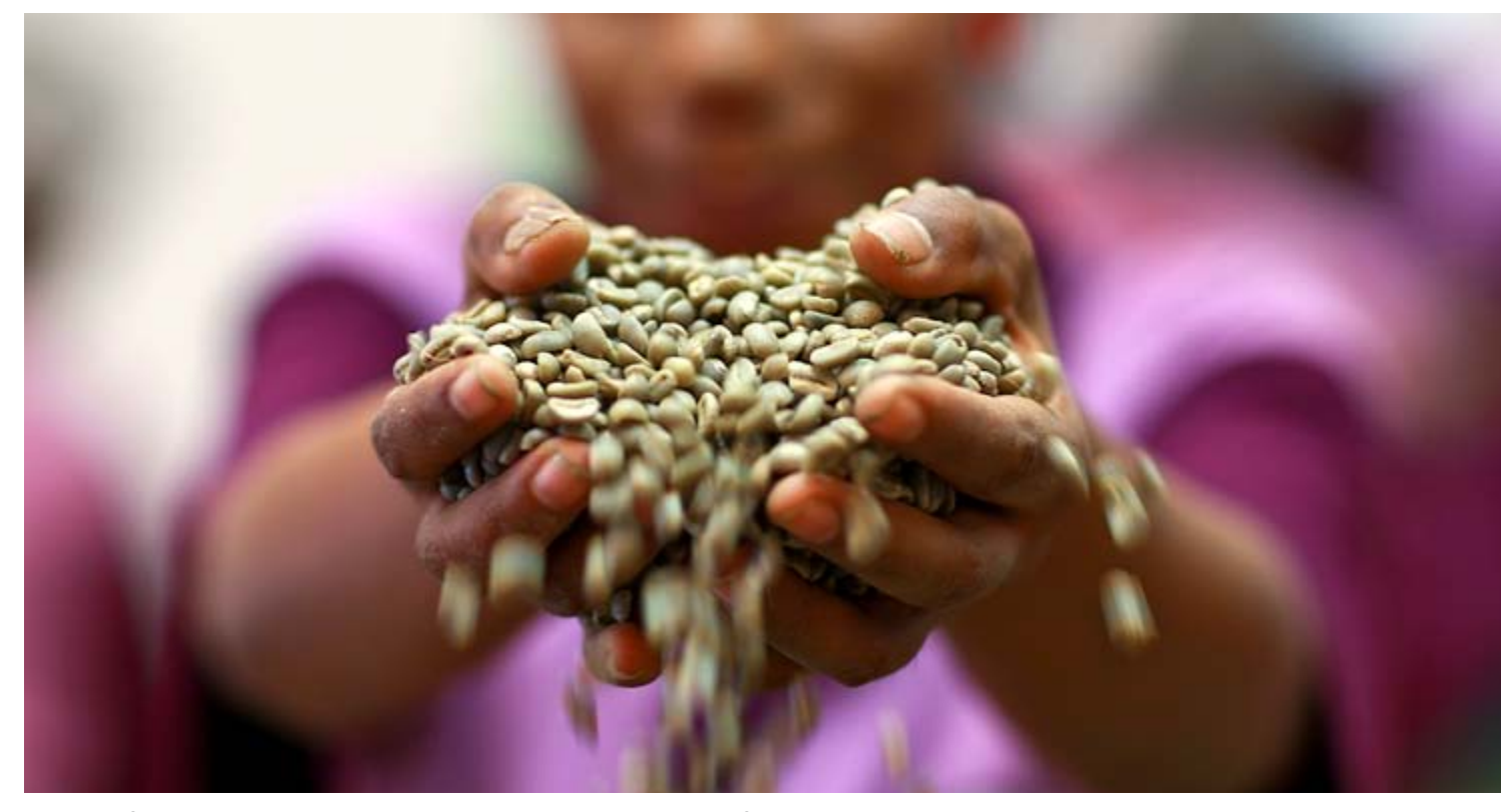
A number of developing countries, such as Timor-Leste, have decided to opt out of the GPA, in order to better protect key domestic industries such as coffee.

requirements. Furthermore, joining the GPA makes it harder to introduce and execute secondary policies through public procurement such as supporting minority businesses or environmental protection.