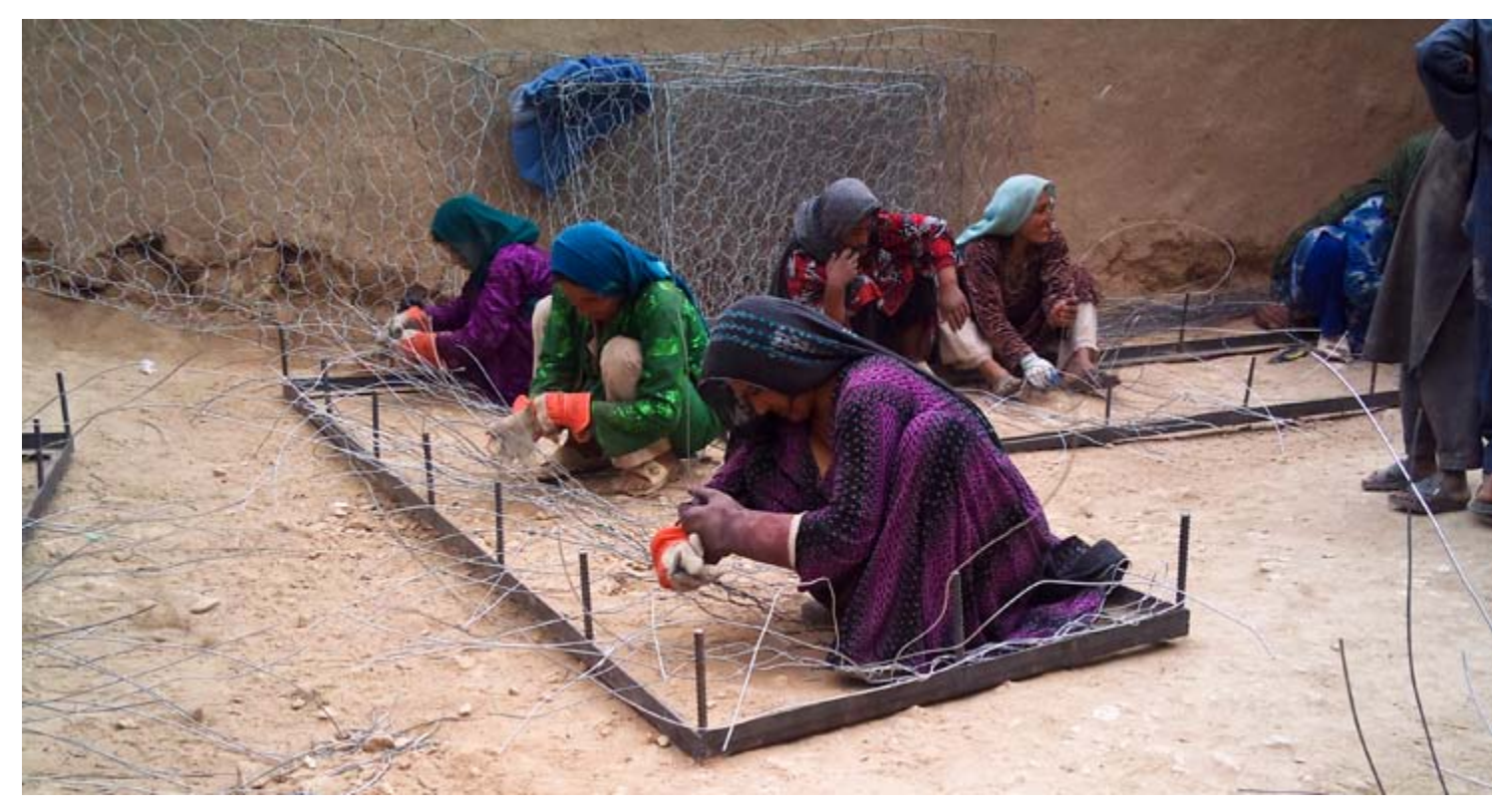
Women preparing wire baskets known as gabions as part of the Rural Access Improvement Project funded by Sida in northern Afghanistan. The gabions will be filled with stone and used to rehabilitate roads in the Sar-e-pul and Samangan provinces.

managers faced difficulties buying the necessary goods to construct the 113 kilometres of roads needed to link certain isolated communities. In particular, it was a challenge to find the hundreds of high quality gabion boxes (wire cages which are later filled with stone blocks) needed to create retaining walls. As they had already experienced success training local widows to provide the screened gravel necessary for construction, project managers decided to adopt a similar approach, which would also fulfil the project's cross-cutting aim to promote gender equity.