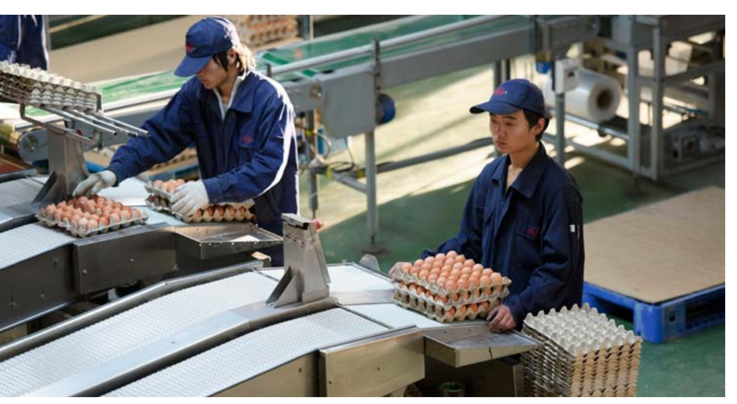
Workers inside the egg processing plant at the Beijing Deqingyuan Agriculture Technology Company in Beijing, China. The company is home to a project supported by the UN Development Programme (UNDP) and the Global Environment Fund which uses manure and water waste from some 3 million chickens to produce biogas for electricity.

Finally, the government should consider providing subsidies to allow the procurement of green products at a higher price than the market. The government can also offer tax breaks to encourage green production and consumption and levy higher taxes on products that cause pollution and over-consumption.